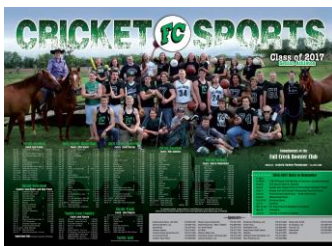
Sports Schedule Poster